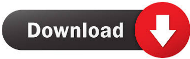
Tableau Desktop Activation Key